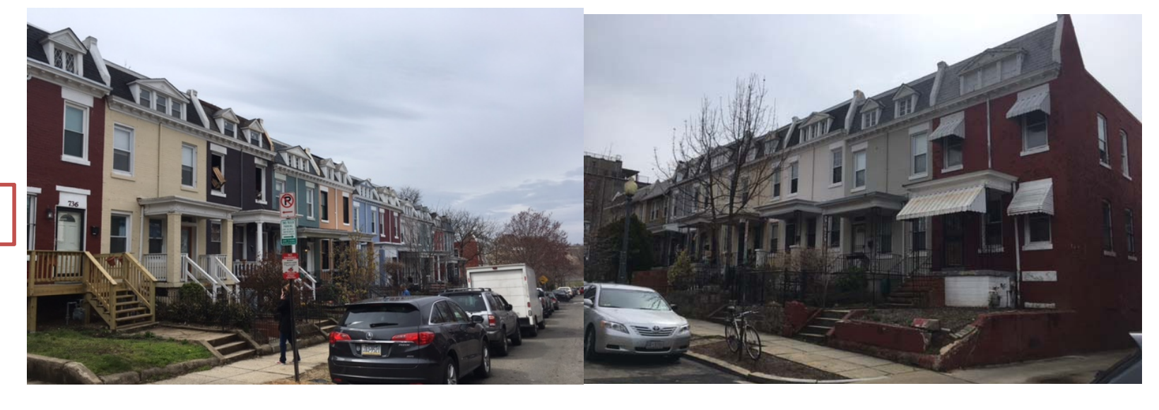
South Side – Hobart Place looking West– North Side