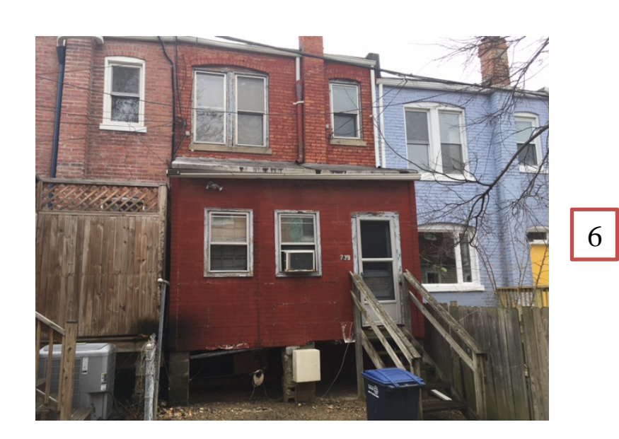
744 Hobart Pl – Rear Façade – Opposing Harvard St property