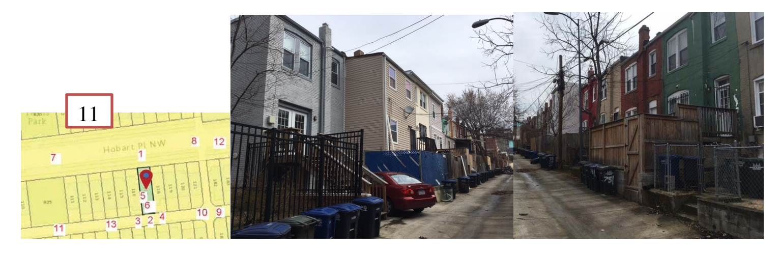
(Hobart\ Place)\ North\ Side-Rear\ Alley\ Looking\ East-South\ Side\ (Harvard\ St)