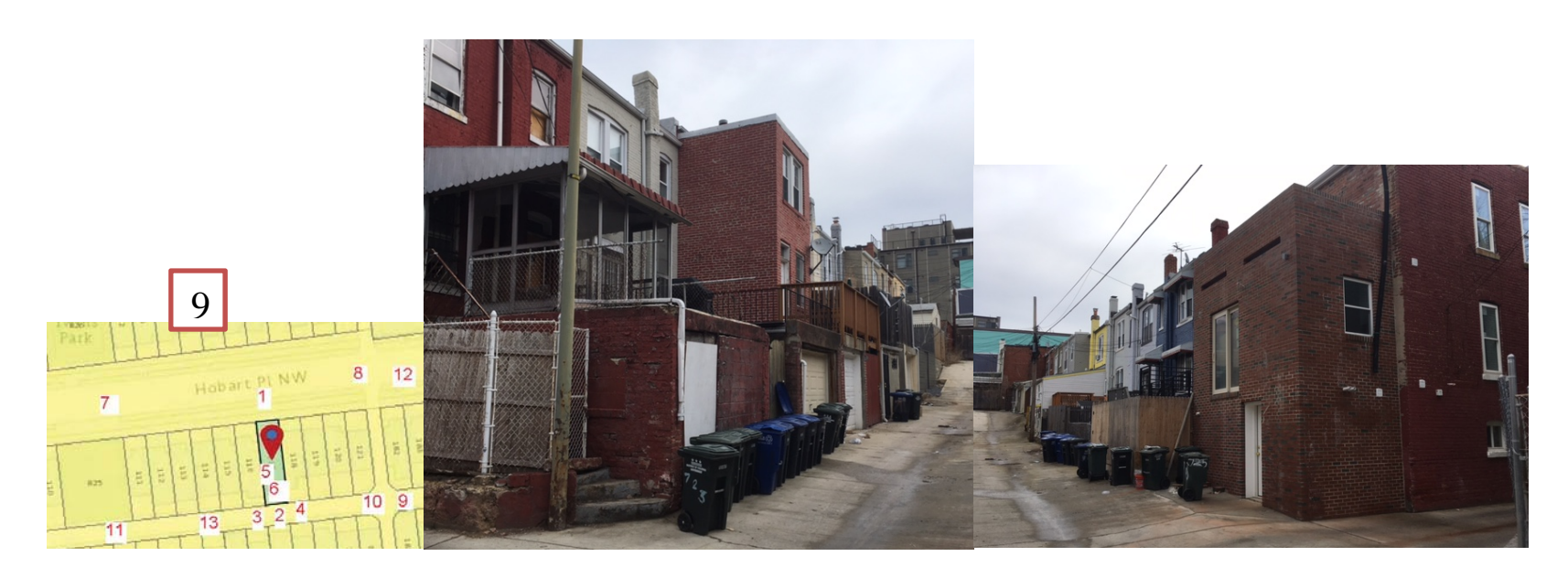
(Hobart Place) North Side – Rear Alley looking East – South Side (Harvard St)