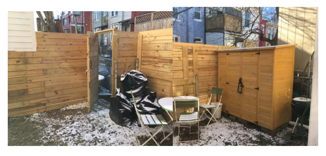
744 Hobart Pl NW – Existing Rear Yard