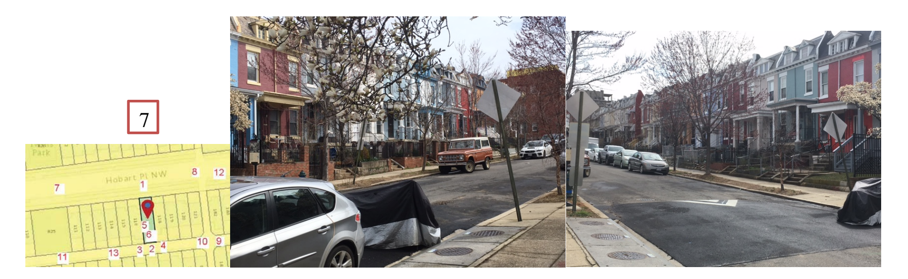
North Side - Hobart Place looking East - South Side